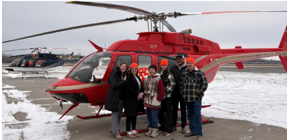
The Watay/OSLP team was pleased to be invited by Wisk Air for a tour of their facilities and to learn more about their work on the Project, including partnerships & Joint Ventures with several First Nation communities.