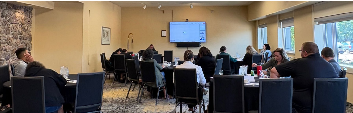
Nihisitotamaakewin was designed for the workers that are entering the Homelands to build and maintain the Wataynikaneyap Transmission Line, including Wataynikaneyap and OSLP.

Opiikapawiiin Services LP provided a Cross Cultural Refresher training session – Nihisitotamaakewin (“An Understanding”) to Opiikapawiiin Services and Wataynikaneyap Power employees on July 3, 2025. The training provides learning from Indigenous Knowledge Holders from the Participating First Nations communities, and includes 15 topics covered through storytelling from the Knowledge Keepers and Elders.