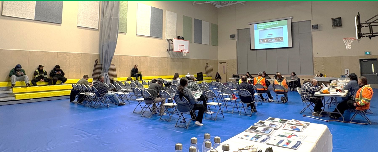
Presenting a Community Information Session to North Caribou Lake First Nation

Wataynikaneyap Power is starting to engage on the Project activities that will be occurring in the Operations and Maintenance stage of the Wataynikaneyap Transmission System, including vegetation management.