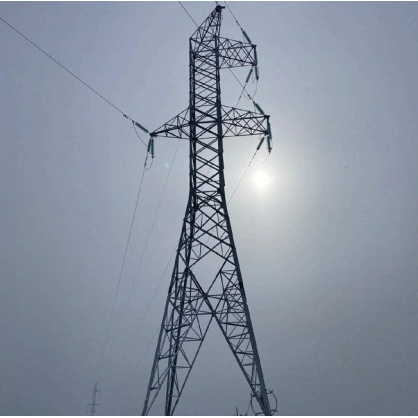
RT064, a dead-end tower (four legged) on line segment RT, on Deer Lake First Nation Homelands

For example, using heavy equipment, tree removal, hauling oversized loads?