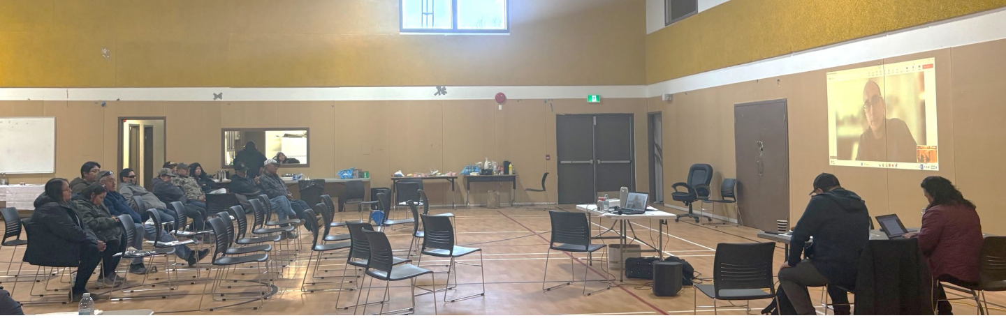
The Wataynikaneyap Power and Opiikapawiin Services Team presenting to Bearskin Lake First Nation

For questions on any engagement matters or to schedule an information session in your community please contact the Indigenous Participation & Engagement Manager at (807) 474 3300 ext. 202