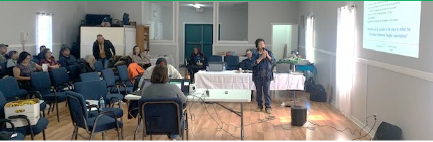
Presenting a Community Information Session to Kitchenuhmaykoosib Inninuwig

The Vegetation Management plan is a plan that Wataynikaneyap will develop through continuous engagement with Participating First Nations (PFN's) to promote growth and manage the height of vegetation to protect assets. Engagement will: • Involve continuous dialogue with land-users, community members, First Nation leadership, and Elders; • Seek to understand how vegetation management should be conducted on your homeland; • Seek to understand what equipment and resources your First Nation has to complete Vegetation Management Work; • Respect and Understand Barriers and Needs Engagement on the vegetation management plan will be ongoing throughout 2024 – 2026, with the initial round of vegetation management on the right-of-way starting in 2026. (Each line segment will typically need vegetation management on a 5-8 year cycle!)